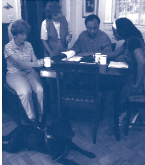
Organize a network for your home, school, workplace, volunteer site, and any other place where you spend a lot of time.

Do not depend on only one person. Include a minimum of three people in your network for each location where you regularly spend a lot of time during the week.