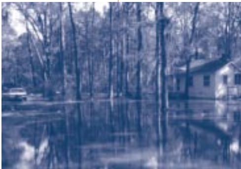
In a disaster, roads and sidewalks may be covered by mud, water, or debris. You may not be able to tell where roads and sidewalks begin or end.

or debris, so you may not be able to tell where they begin and end. Mud, sand, and other materials may be left behind for long periods. In floods, the water may be moving very rapidly. This can keep you from leaving an area.