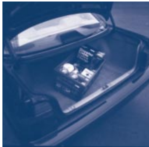
Store basic disaster supplies and other emergency items in your car.

Some generators can be connected to the existing wiring systems of a house. But contact your utility company before you connect a generator to house wiring. Connecting a generator is specifically prohibited by law in some areas, so you must check with your local utility or fire department first. To run generators in an emergency, fuel must be safely